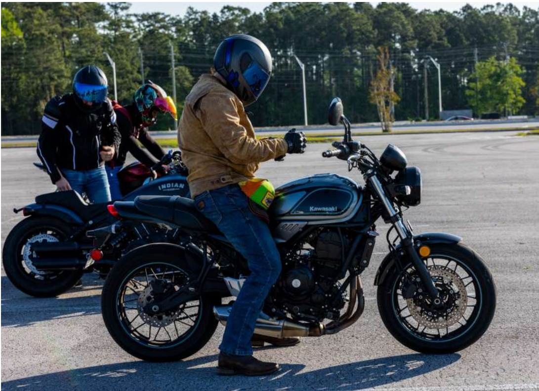
U.S. Marines with 2d Marine Division (MARDIV) participate in a Motorcycle Awareness event on Camp Lejeune, North Carolina, April 21, 2023. The Motorcycle Awareness event allowed Marines from 2d MARDIV to practice motorcycle safety with fellow riders in a controlled environment.

Additional Rider Down reports are available here: https://navalsafetycommand.navy.mil/Resource/Motorcycle-Rider-Down-Reports-Newsletters/ .