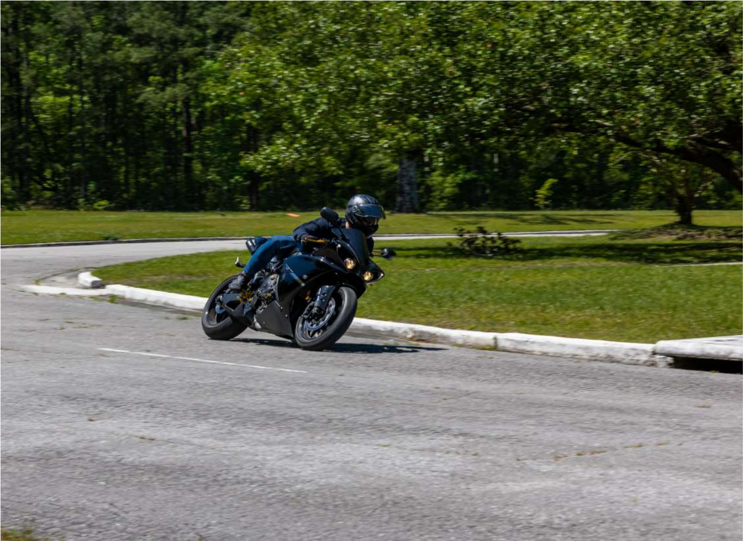
A U.S. Marine with 2d Marine Division turns a corner during a Motorcycle Awareness event on Camp Lejeune, North Carolina, April 21, 2023. The event allowed Marines from 2d MARDIV to practice motorcycle safety with fellow riders in a controlled environment.